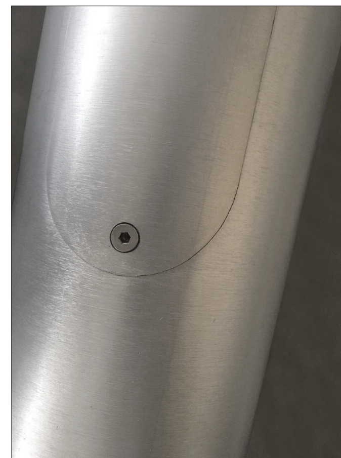
FLUSH HATCH DETAIL