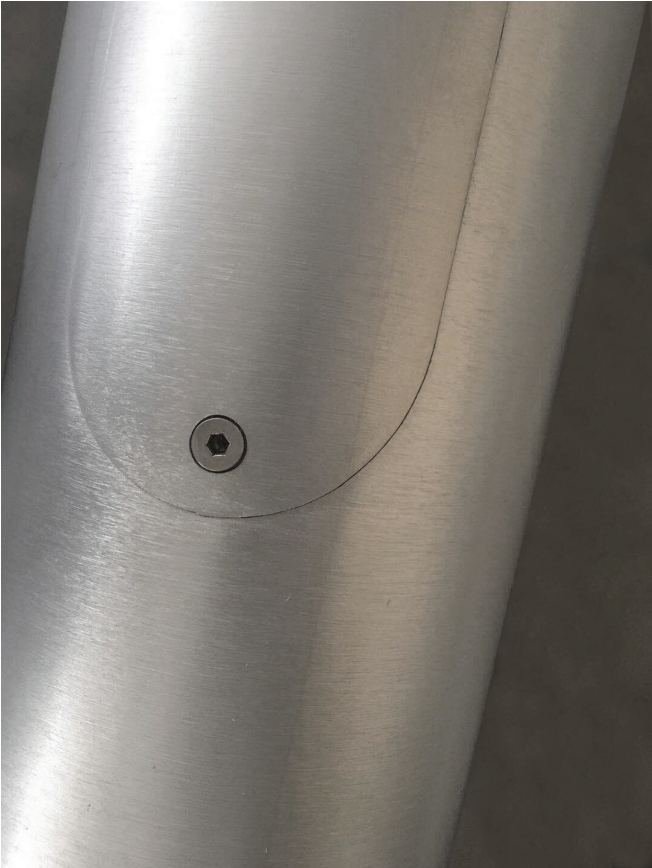
FLUSH HATCH DETAIL